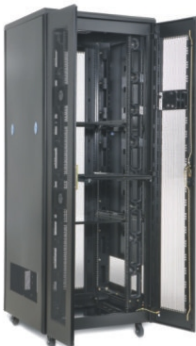
Dual Rear Doors fully perforated - shown in a 800mm wide cabinet

APW Presidents CYBERack is high on fine styling and value-for-money features. It has been designed and engineered specifically for easy assembly and rapid equipment integration at site.