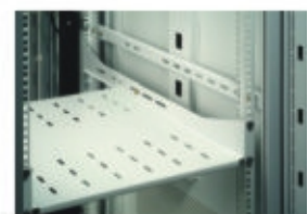
Equipment Tray - variable mounting depth