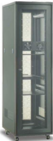
Fully Perforated Steel Door