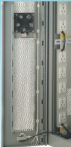
Cascaded AC Channels, recessed mounting