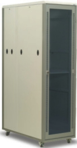
Glass Door with vented side trims