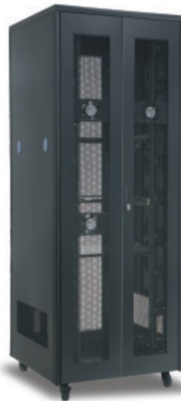
Dual Rear Doors - fully perforated