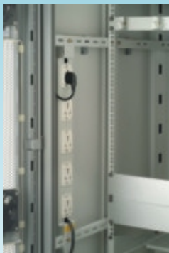
Recessed Mains Channels