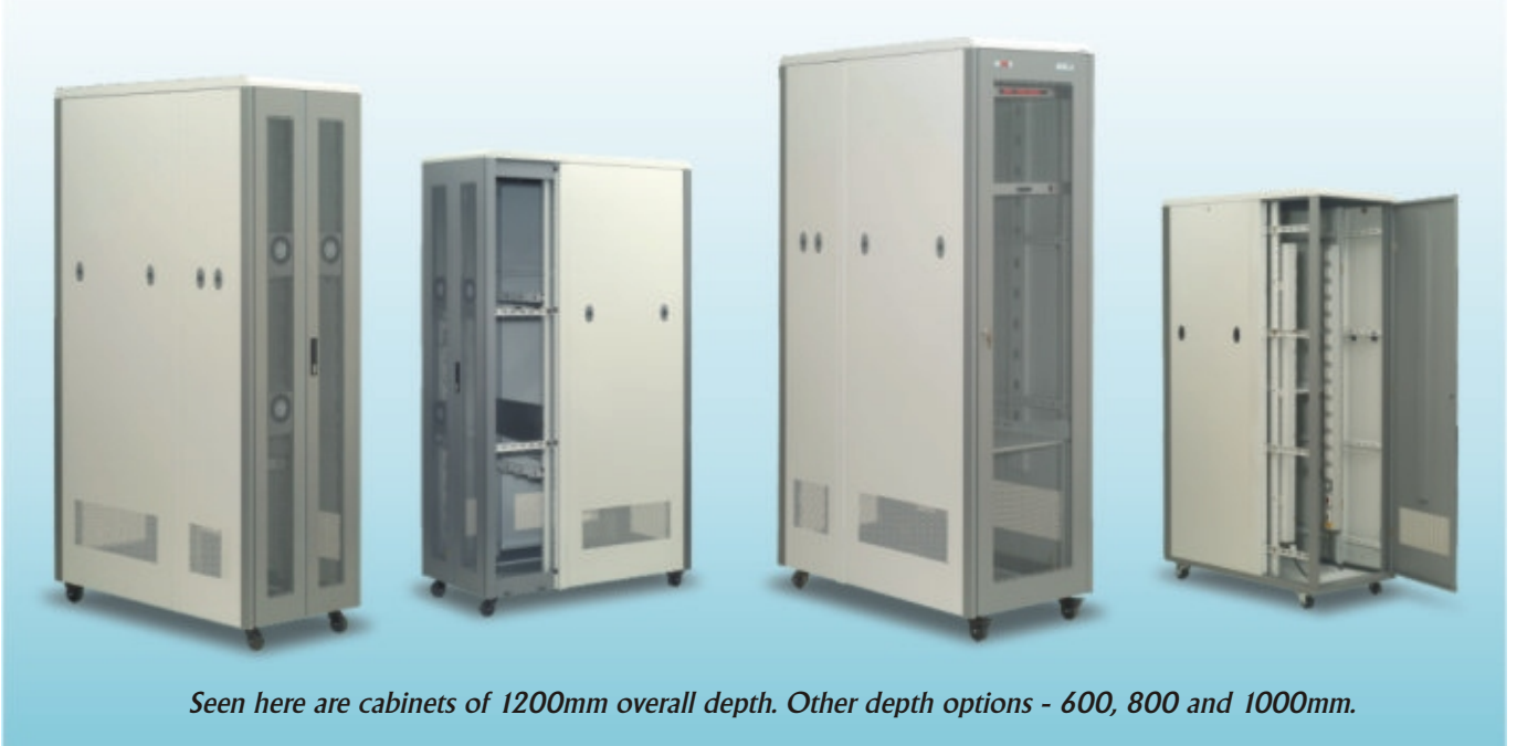
Seen here are cabinets of 1200mm overall depth. Other depth options - 600, 800 and 1000mm.