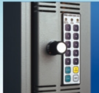
Electronic Locking Systems - two styles to choose from.