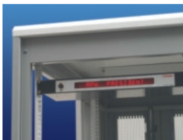
Alphanumeric Display Unit

Some other accessories for use with CYBERack & CYBERack DLX