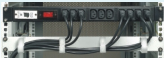
19" IEC Socket Strip