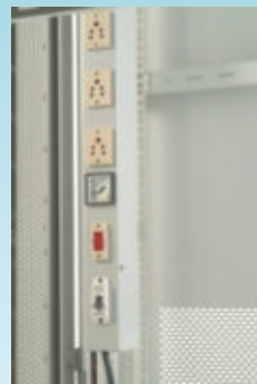
Mains Channels with Ammeter