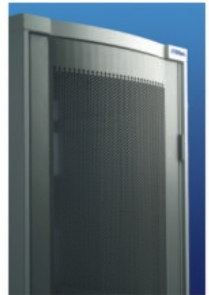
Convex Door - fully perforated

Designed for optimal front-to-rear airflow