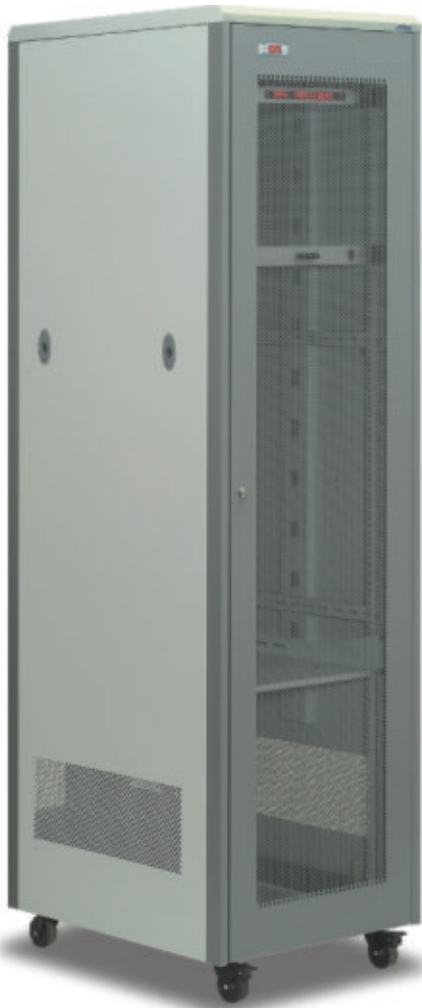
Front view - with fully perforated steel door