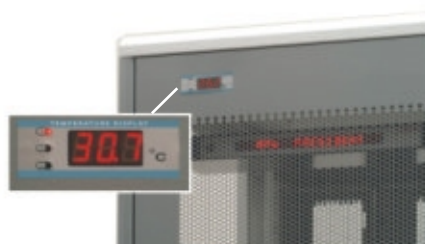
Temperature Indicators - multizone